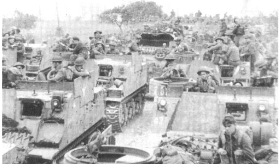
Canadian infantry mounted on Kangaroo Armoured Personnel Carriers prior Operation Totalize, Normandy, 7 August 1944. Canadian performance in Normandy has been hotly debated over the last several years. Our efforts to learn the truth must be based on evidence and analysis—not on patriotism, widespread assumptions and sweeping generalizations—and that establishing the truth, no matter how unpalatable, is important.

There are two great difficulties with which the professional soldier, sailor, or airman has to contend in equipping himself as a commander. First, his profession is almost unique in that he may have to exercise it only once in a lifetime, if indeed that often. It is as if a surgeon had to practice throughout his life on dummies for one real operation; or a barrister appeared only once or twice in court towards the close of his career; or a professional swimmer had to spend his life practicing on dry land for an Olympic championship on which the fortunes of his entire nation depended. Second, the complex problem of running an army at all is liable to occupy his mind and skill so completely that it is very easy to forget what it is being run for . The difficulties encountered in the administration, discipline, maintenance, and supply of an organization the size of a fair-sized town are enough to occupy the senior officer to the exclusion of any thinking about his real business: the conduct of war. It is not surprising that there has often been a high proportion of failures among senior commanders at the beginning of any war. These unfortunate men may either take too long to adjust themselves to reality, through a lack of hard preliminary thinking about what war would really be like, or they may have had their minds so far shaped by a lifetime of